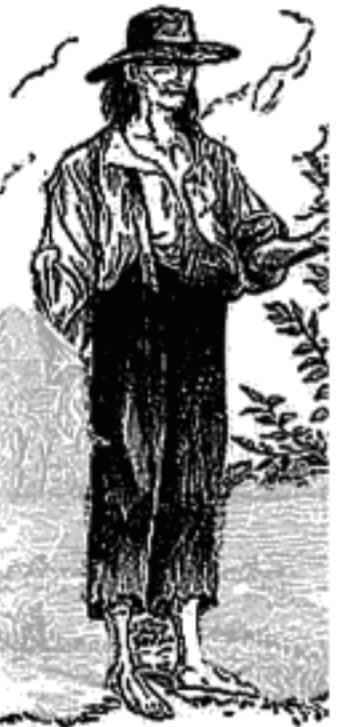
THE LEGEND OF JOHNNY APPLESEE

To remove the smell of smoke from clothing, add a cup of vinegar to a tub of hot water. Let clothing hang in the same room for several hours.