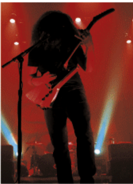
Left: Claudio Sanchez of Coheed and Cambria at UPAC, Kingston, Sept. 13, 2012