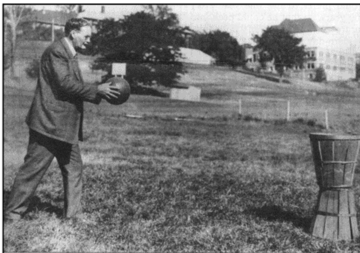
He asked for boxes, but all the janitor had were two old peach baskets.

During the next few years basketball became the game we know today. Backboards were devised, first wood, then glass. To keep the ball from bouncing away a net was introduced, a new ball was designed and more rules were added. Jim Naismith left Springfield for the foothills of the Rockies. At the University of Colorado he studied medicine because he felt he could better direct young men's physical activities if he knew more about the body. After graduation he moved on to the University of Kansas in 1898, at the age of thirty six where he lived the remainder of his forty one years.